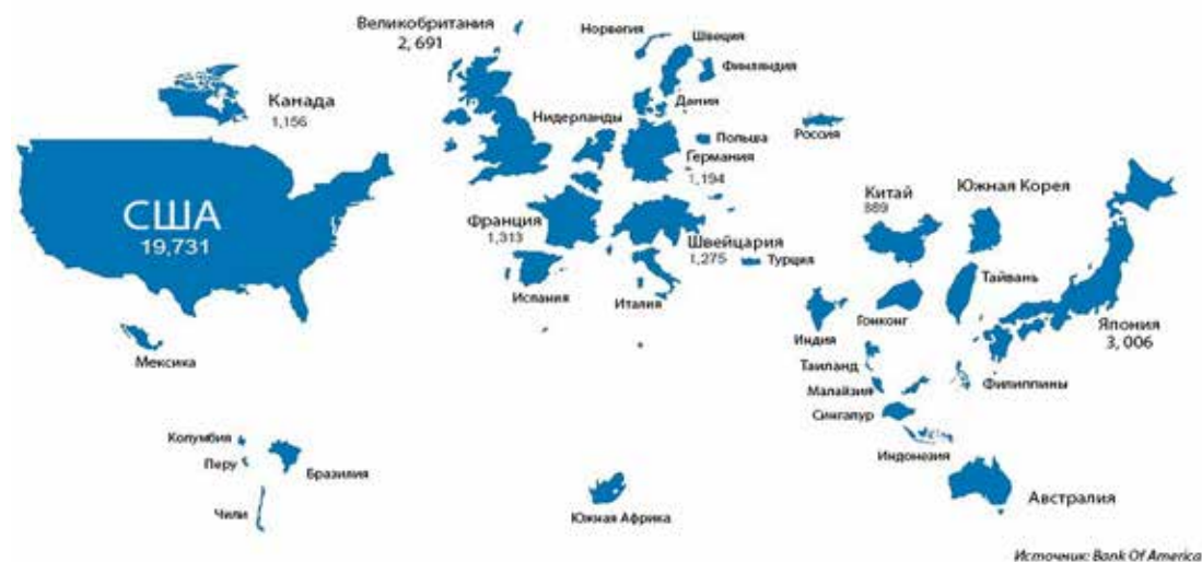
Figure 2. The world according to free-float equity market capitalization ($bn)

Firstly, the banks in the Ukrainian banking system are two small in relation to the