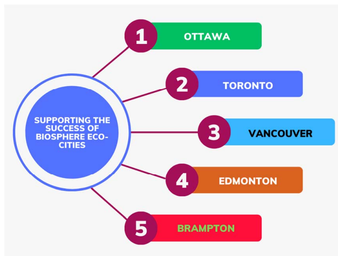
Figure 2. Structure biosphere Eco-Cities (BECs)