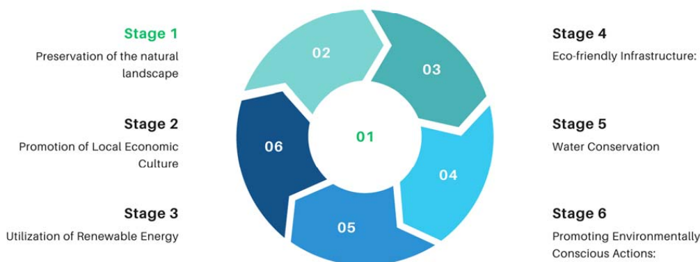
Figure 3. Steps Required for Transforming Cities into Green Cities