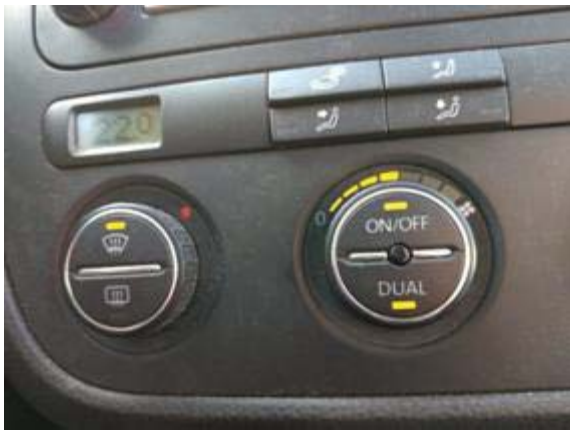
Fig. 4: Medium-cycle Ventilation