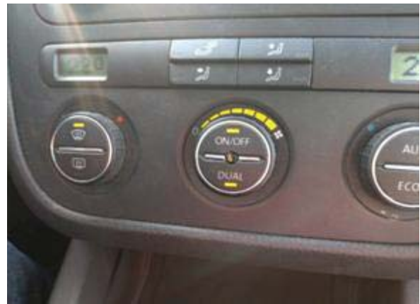
Fig. 5: Full-Flow Ventilation

Results and discussions. After discharge of our devices we obtain the following results: