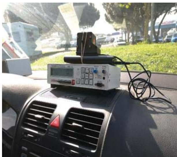
Fig. 2 : Positioning of metrology