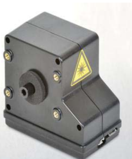
Fig. 3 : OPC ALPHASENSE N3

In order to monitor pollutant concentrations, two types of particle counters were used: