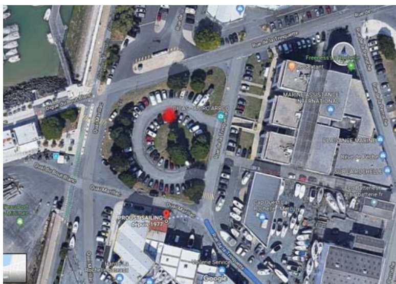
Fig. 1. Location of the experimental site

Metrology and experimental protocol. As part of a static experiment, we mobilized a WOLKSWAGEN brand vehicle model GOLF with diesel engine. The mania was conducted on the parking lot near the street of the staysail in La Rochelle in France, as illustrated in the image below, the red spot indicating the exact point of positioning of the vehicle used.