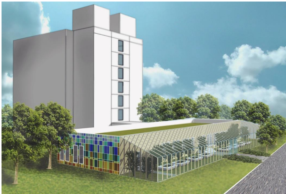
Fig. 2. Greenhouse attached to the Center's building from the southern and eastern side

To reduce heat loss through the building envelope we proposed to do measures for the thermal insulation protection of the external building envelope and to attach the greenhouse on the southern and eastern side of the building [4].